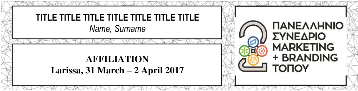
Figure 2: Title Zone Layout